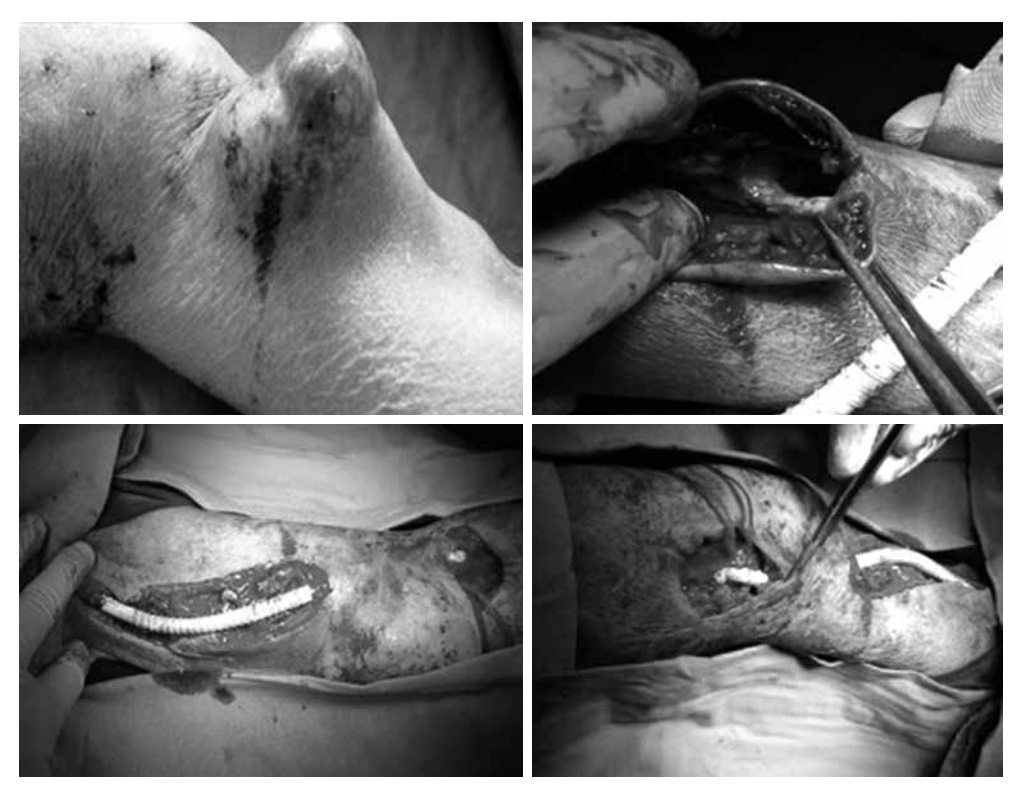
\label{eq:Figure 3.} {\it End-to-end graft interposition due to concomitant brachial arterial aneurysm}.