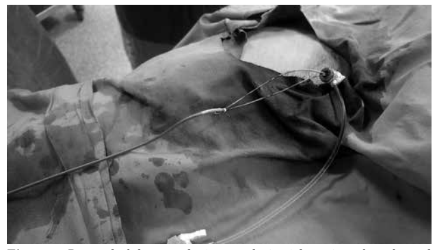
Figure 3. Removal of the second wire, caught in right atrium, from femoral vain

vein percutaneous catheterization was applied from the inguinal region. Under the guidance of C-arm fluoroscopy, a catch wire was sent, and the second wire was caught in the right atrium and removed from the femoral vein (Figure 3). Examination of the retrieved wires showed that the carrier rough wire, which was broken into two components, and the elastic helical wire sections wrapped on it were separated from each other. After surgery, echocardiography and complete blood count were performed. The patient was discharged without any complication and with full recovery on the postoperative second day.