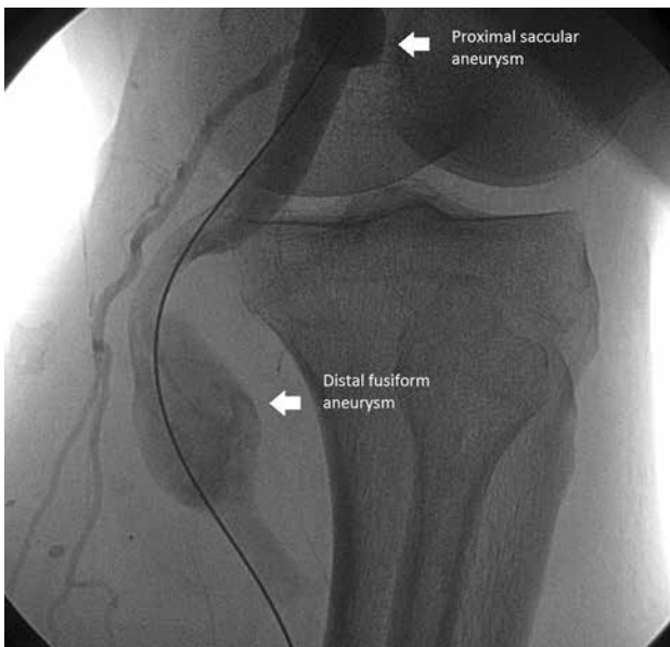
Figure 1. An intraoperative angiographic image of proximal and distal aneurysms of popliteal artery.