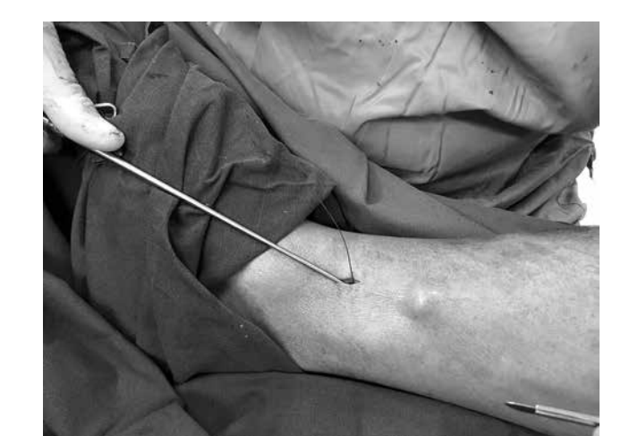
Figure 2. The stripper was gently advanced through the incision line.

All preparations were made from 1.5 to 2 cm distal part of the grafts and were examined before dilating with the solution. Thus, the effect of pressureinduced trauma on histopathological examination was ruled out. The preparations were taken into 10% formalin and routine tissue examination procedure was performed in the paraffin block. Tissue identification was made using hematoxylineosin staining. Endothelial and interstitial structures, fibroblastic activity, leukocyte invasion, edema, and necrosis were examined.