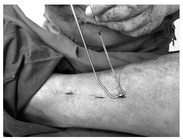
Figure 3. Harvesting the graft.