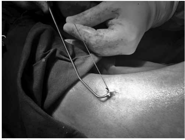
Figure 1. First incision.