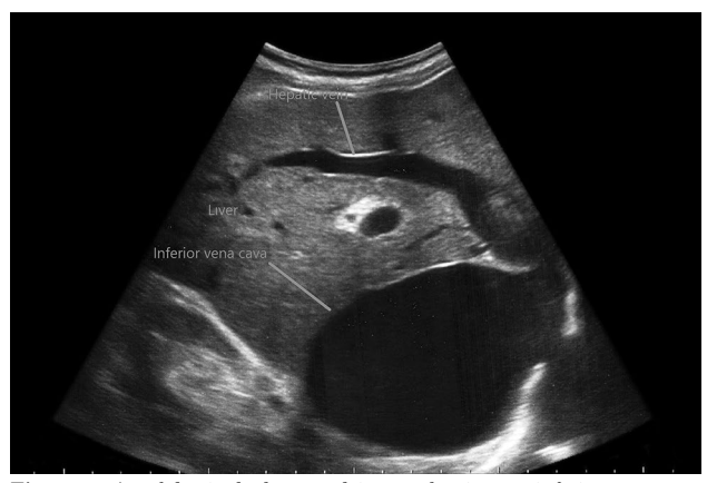
Figure 1. An abdominal ultrasound image showing an inferior vena cava aneursym.

A mild-to-moderate mitral insufficiency, an advanced tricuspid valve regurgitation, and an advanced right ventricular failure were observed. The right atrial diameter was about 95 to 100 mm in the largest segment. Other than dyspnea, he had no symptoms or physical examination findings associated with cardiac failure.