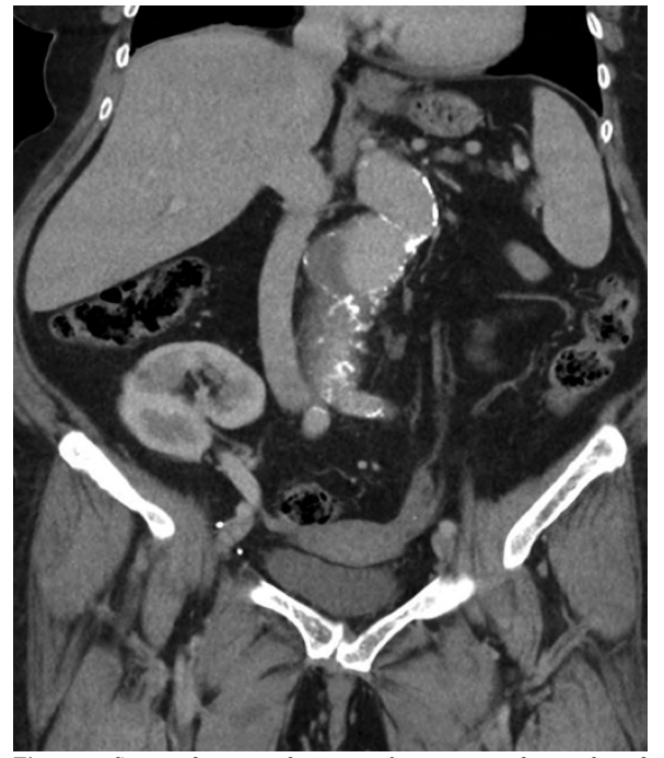
Figure 1. Computed tomography image of aneurysm and transplanted kidney.