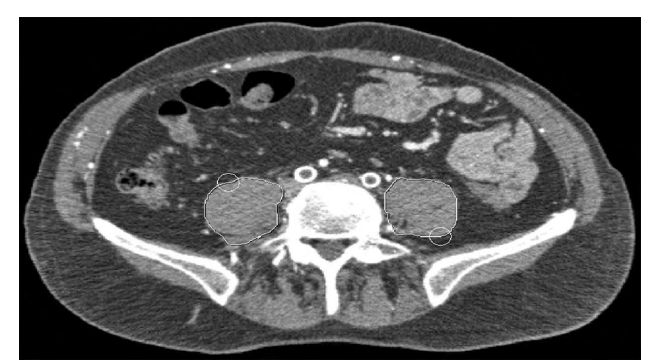
Figure 1. Assessment of transverse computed tomography angiogram at the level of the fourth lumbar vertebra (L4). The area of each psoas muscle was measured individually and both were summed for each patient.