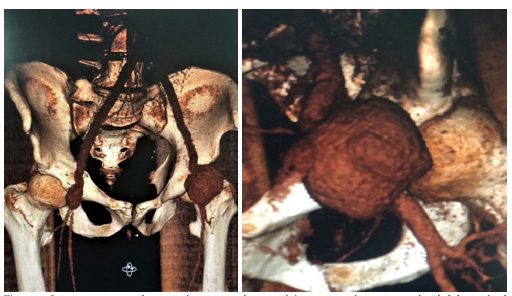
Figure 1. Preoperative computed tomographic angiography view of the giant pseudoaneurysm and occluded superficial femoral artery.

Laboratory test results were within normal ranges with no signs of infection. An urgent operation was planned a written informed consent was obtained from the patient.