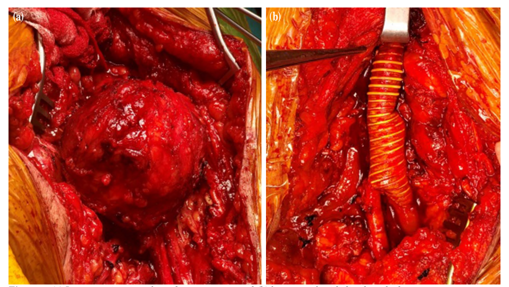
Figure 2. (a) Intraoperative view of pseudoaneurysm sac and (b) bypass graft with distal patch plasty.

that the left femoral anastomosis of aortobifemoral bypass graft was dissociated with no sign of infection. The graft within the pseudoaneurysm sac was completely detached from the anastomotic site and there was atherosclerotic stenosis in the lumen of the CFA, extending to the SFA. Therefore, it was decided to perform endarterectomy and patch angioplasty intraoperatively. Endarterectomy was performed to secure the SFA and DFA orifices, and bypass was also performed with a 10-mm ringed polytetrafluoroethylene graft via an end-to-end proximal anastomosis with old graft and distal patch