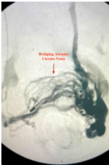
Figure 4. Catheterization of the distal ovarian vein on the left with after contrast injection visualization of the left ovarian vein plexus, the uterine plexus and (part of) the right ovarian vein plexus. Note that there are also communicating veins to the internal iliac vein systems visible.