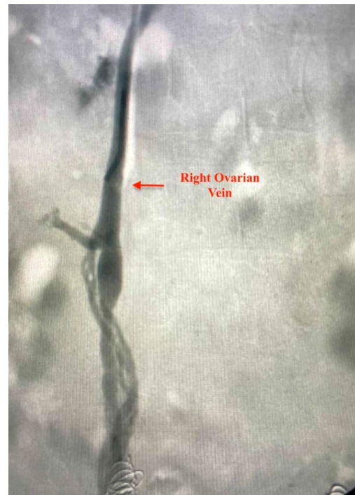
Figure 2. Catheterization of the right ovarian vein with after contrast injection visualization of the (dilated) right ovarian vein. Distally, we can see coils in the left and right internal iliac veins.