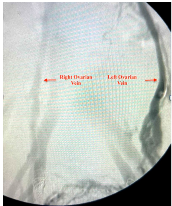
Figure 5. Catheterization of the left ovarian vein with after contrast injection filing of both the pelvic plexus (ovarian, uterine) as well as the deep iliac veins. Note the overflow of contrast from the left ovarian vein system to the right. There are some coils in situ distally at the level of the internal iliac veins.

Ovarian vein diameter is considered normal, if it is measured within 1 to 4 mm; moderate, 5 to 8 mm; and severe, \geq 8 mm. [19] In a study, the diameter of left ovarian vein in patients with PeVD was significantly larger in symptomatic individuals, compared to healthy individuals. [20] In addition, the positive predictive value of GV insufficiency for a left ovarian vein diameter of 5 mm was found to be 71% and of 6 mm was found to be 83%. [21] Although, ovarian vein diameter is a diagnostic criteria in the UIP consensus document, it has been shown to be a poor predictor of GV reflux. [22] The aforementioned study showed a sensitivity, specificity, and accuracy of a diagnosis according to this 8-mm cut-off value of 53%, 60%, and 56%, respectively. Moreover, in an another study, PeVD symptoms did not depend on the degree of expansion of the pelvic veins. [23] Although the incidence of PeVH increased with the increased vein diameters in the recent SVP classification, the authors abstained from specifying the exact vessel diameter. [9]