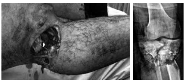
Figure 2. Preoperative photograph and X-ray of our second case: Left popliteal artery and vein injuries together with the bone fractures, and near-subtotal amputation are seen.

nerve repair, open reduction and internal fixation of right lateral malleolus of tibia and debridement were performed by the orthopedist and neurosurgeon. On control examination two hours later, we observed that the saphenous vein grafts have been thrombosed. Repeat thrombectomy was performed, and the patency of the grafts were achieved; 2 U of erythrocyte suspension and 1 U of fresh frozen plasma were replaced intraoperatively, and the patient was taken to cardiovascular surgery intensive care unit. During postoperative follow-up, four-compartment fasciotomy was performed liberally to prevent compartment syndrome below the open left knee through both medial and lateral longitudinal incisions. Heparin infusion (1000 U/hour) was administered, and the patient was followed by hourly measurements of activated clotting time (ACT). The patient had minimal bleeding, in the style of leakage from the bandage, however heparin infusion was continued, and ACT was kept over 200 seconds. Two units of erythrocyte suspension were replaced on the first postoperative day, and subcutanous low-molecular-weight heparin (LMWH) (enoxaparin), 1000 IU/10 kg twice daily was given instead of heparin after the first 24 hours. Distal pulses were palpable in both lower extremities on the postoperative examination. Then, the patient was transferred to plastic surgery and orthopedics clinics. The soft tissue defect was reconstructed with free vascularized soft tissue flap transfer by plastic surgeons.