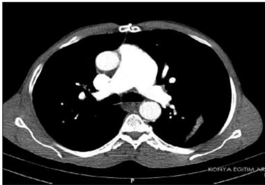
FIGURE 2B: Computerized tomography: Relapsed main pulmonary artery aneurysm.

on an individual basis. Endovascular treatment can be a good alternative therapeutic technique. 8