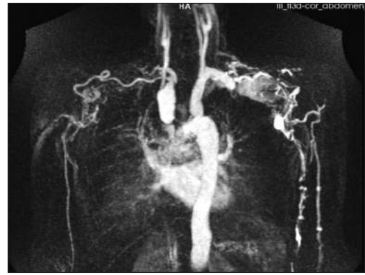
FIGURE 1A: Magnetic resonance imaging: Aneurysm of right innominate artery and occlusion of left subclavian artery.

Behcet's Disease is a multisystemic chronic autoimmune inflammatory disease characterized by recurrent oral and genital aphthous ulcers and ocular lesions. Arterial involvement in Behcet's disease is rare, thrombosis and/or aneurysms are observed, being mainly false aneurysms. 4 These "arterial aphtae" are localized on pulmonary arteries, aorta, renal and peripheral arteries. Vascular surgery is obligatory, but graft thrombosis and relapse of