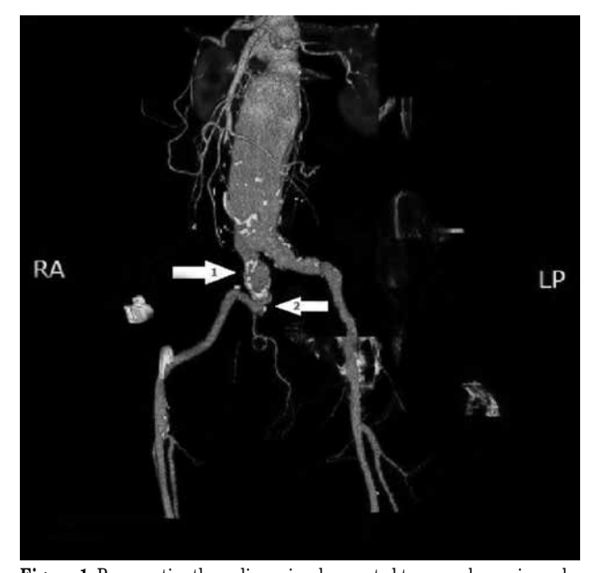
Figure 1. Preoperative three-dimensional computed tomography angiography reconstruction. Arrow 1: A right common iliac aneurysm; Arrow 2: A severely tortuous right iliac artery with "S" appearance.

A total of 31 octogenarian male patients (mean age 82±1.8 years; range 81 to 89) treated with elective EVAR between January 2013 and January 2017 were retrospectively analyzed from a prospective database maintained by the division of cardiovascular surgery at Medicine Faculty of Manisa Celal Bayar University. Endovascular treatment protocol of patients was adopted from a previous report.<sup>[10]</sup> Preoperatively, all patients underwent computed tomography (CT) imaging. Aneurysm stent planning maps were produced prior to EVAR using a Vital 3D Recon device (Toshiba Medical Systems, the Netherlands). For data analysis, patients were divided into two groups based on arterial access anatomy. Hostile artery anatomy was defined as presence of iliac artery aneurysm (≥17 mm in males or ≥15 mm in females) at any point, severe (≥50%) artery stenosis, or severe tortuosity of iliac artery ('S' appearance) (Figures 1 and 2).[11] If present, patients with hostile neck anatomy were excluded. Our clinical protocol is to preferentially perform EVAR in AAA patients over the age of 65 years. The Endurant II EVAR device (Medtronic Cardiovascular, Santa Rosa, CA, USA) was used in