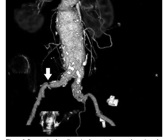
Figure 2. Preoperative three-dimensional computed tomography angiography (reversed reconstruction). Arrow: Severe stenosis in left external iliac artery.