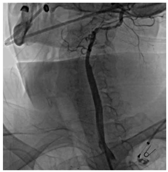
Figure 2. Treatment of pseudoaneurysm with covered stent graft.

The treatment modalities are open surgery and endovascular therapy. Primary repair of the pseudoaneurysm or using a patch for the repair are the open surgical techniques. Open surgery is the traditional treatment modality<sup>[5]</sup> and is curative; however, exploring the pseudoaneurysm and clamping the responsible artery may be sometimes challenging. In particular, the risk of hemorrhage cannot be ruled out.<sup>[5]</sup> Also, the cranial nerve