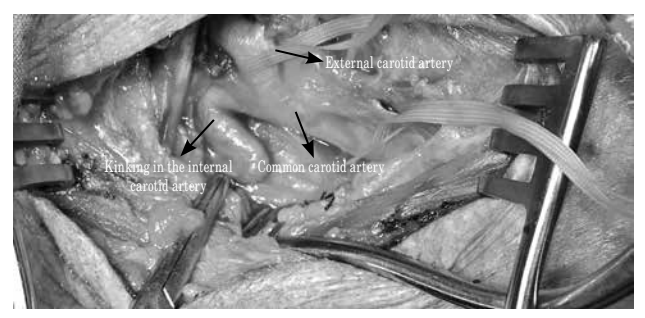
Figure 2. Intraoperative image of kinking in the internal carotid artery.