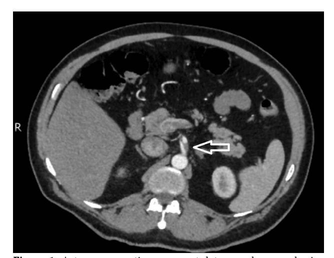
Figure 1. A transverse section on computed tomography scan showing dissection in superior mesenteric artery (arrow).

The patient continued to have significant pain on eating, significant hypoalbuminemia, and temperature spikes, despite antibiotic treatment. Edematous viable