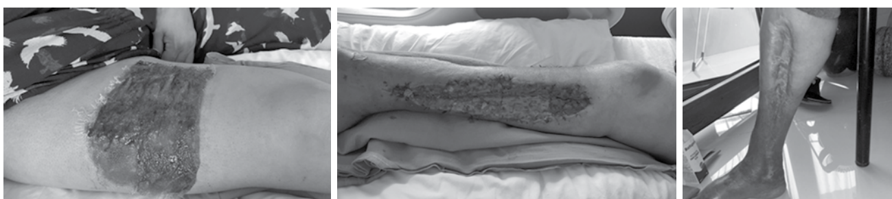
Figure 3. A patient treated successfully using split-thickness skin graft.

arteriovenous fistula repair, and peripheral cannulation for cardiac surgery). Eleven of them (17.2%) had primary peripheral arterial disease. Two patients (3.1%) required