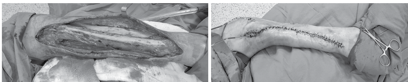
Figure 2. A wound successfully closed up after vacuum-assisted closure therapy.