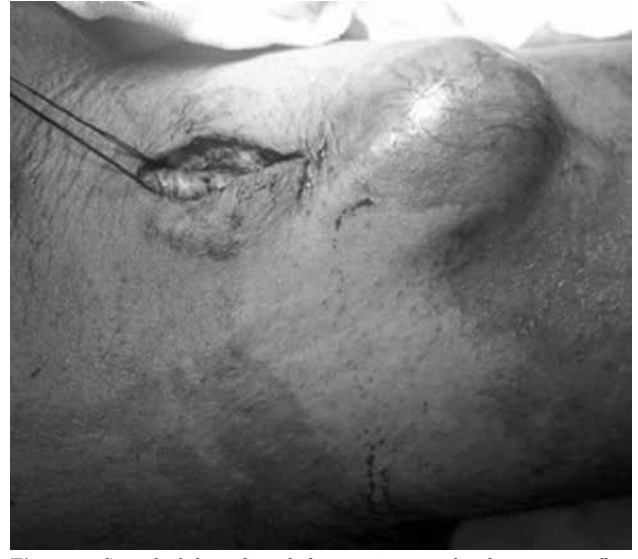
Figure 1. Control of the radiocephalic arteriovenous fistula aneurysm flow during surgical operation.

The patient was taken to the operating room and prepped in the usual manner. Skin and subcutaneous