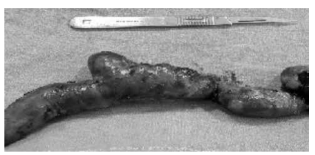
Figure 5. Resected of the mass of the brachiobasilic arteriovenous fistula aneurysm.

Surgical treatment of this AVF aneurysm is shown in Figures 5 and 6, respectively. Following the control of bleeding, the incision site was closed appropriately after placing a Penrose drain or a Hemovac drain (Bicakcilar, Istanbul, Turkey), if necessary. A