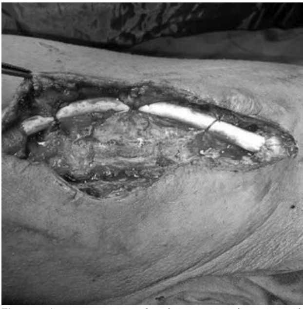
Figure 3. Aneurysm resection and graft interposition of a patient with radiocephalic arteriovenous fistula aneurysm.