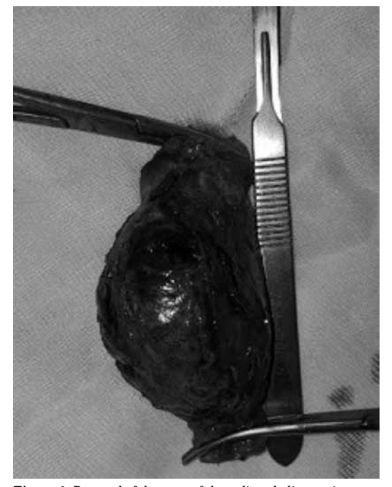
Figure 2. Resected of the mass of the radiocephalic arteriovenous fistula aneurysm.

areas were anesthetized with local anesthesia. The aneurysm sac was controlled by proximal and distal of the brachial or radial arteries after 5,000 IU heparin was given for anticoagulation. An AVF aneurysm due to the puncture site in the forearm of the patient with radiocephalic AVF and hanging of the brachial artery for the control of the AVF flow are shown in Figure 1. The skin of the pulsatile mass was incised, and the subcutaneous tissue was passed. All AVF aneurysms were true aneurysms. Aneurysm resection and saphenous vein graft and/or synthetic graft interposition, ligation, and aneurysmorrhaphy (partial aneurysm resection and plication) were performed in 62, 5, and 14 patients with radiocephalic AVF aneurysms (AVF aneurysms were in the left arm in 68 and in the right arm in 13), respectively. A resected mass of the radiocephalic AVF aneurysm is shown in Figure 2 and synthetic graft interposition after the resection in the same patient is shown in Figure 3. Aneurysm resection and saphenous vein graft and/or synthetic graft interposition, aneurysm ligation, and aneurysmorrhaphy were performed in 10, 7, and 5 patients with brachiocephalic and brachiobasilic AVF aneurysms (AVF aneurysms were in the left arm in 17 and in the right arm in five) respectively. Also, 10 and 12 patients had brachiocephalic and brachiobasilic AVF aneurysms, respectively. A brachiobasilic AVF aneurysm is shown in Figure 4 in another patient.