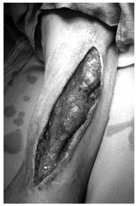
Figure 4. Brachiobasilic arteriovenous fistula aneurysm.

Surgical treatment of this AVF aneurysm is shown in Figures 5 and 6, respectively. Following the control of bleeding, the incision site was closed appropriately after placing a Penrose drain or a Hemovac drain (Bicakcilar, Istanbul, Turkey), if necessary. A