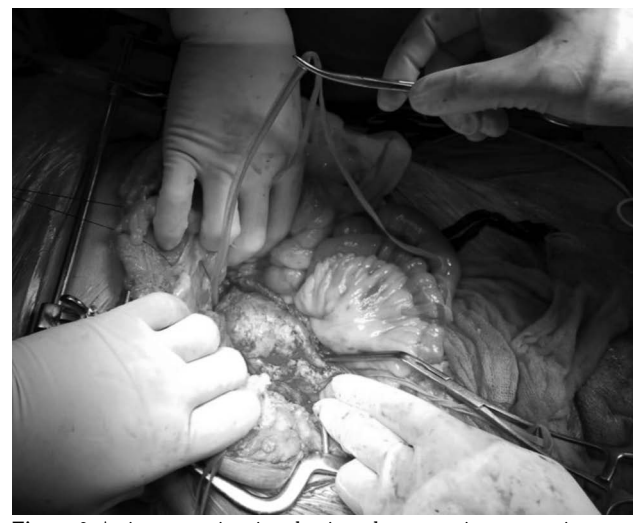
Figure 2. An intraoperative view showing a large superior mesenteric artery pseudoaneurysm with proximal and distal control following the ligation of aneurysm.

Postoperatively, the patient was well and asymptomatic. Postoperative abdominal ultrasonography revealed no flow in the ligated SMA aneurysm (Figure 3).