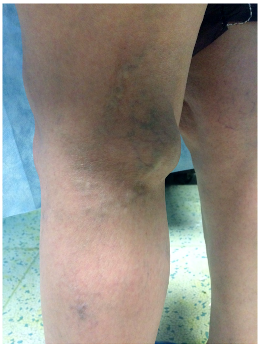
Figure 1. An image showing popliteal mass resembling a Baker's cyst.

molecular-weight heparin was continued for four weeks and, then, switched to acetylsalicylic acid. The patient is still under follow-up without any complaints three months later.