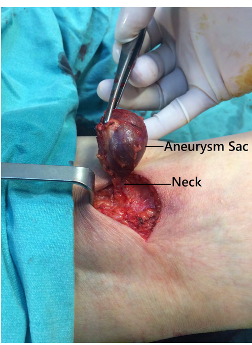
Figure 3. An intraoperative view showing a large saccular popliteal vein aneurysm, its neck, and popliteal vein.

The secondary venous aneurysms can be caused by inflammatory conditions, endovenous interventions, trauma or degenerative changes. [2] Our patient had none of these conditions in her medical history. The etiology of the primary popliteal aneurysm is unclear. Most of the true popliteal vein aneurysms are saccular. Congenital weakness of