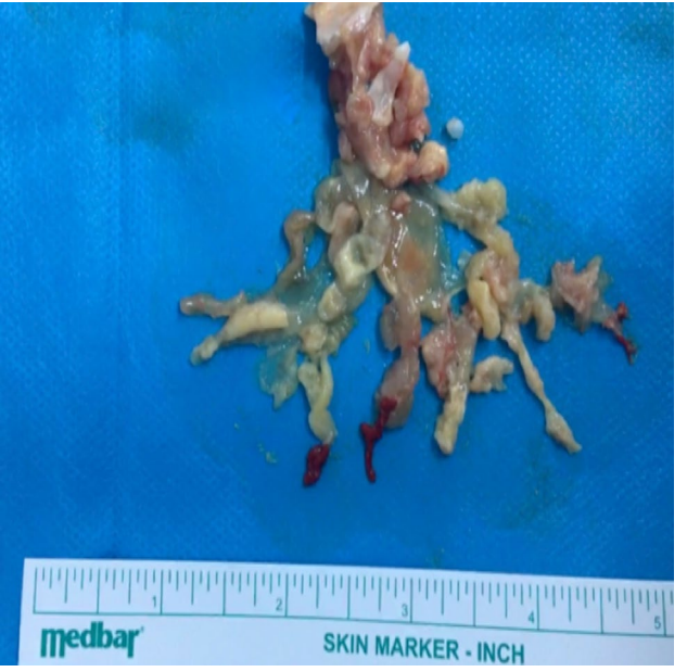
Figure 1. Pulmonary cyst and endarterectomy material.

reached and endarterectomy was performed starting from proximal side proceeding toward the distal vessel. Correct endarterectomy plane was obtained after extracting the larger thrombotic material. The most distal-end endarterectomy was executed during 20-min TCA period. Endarterectomy specimens were circumferentially tracked in each lobe until reaching segmental and subsegmental branches (Figure 1). After reperfusion and closure of the right pulmonary artery incision, the left pulmonary artery was incised. Left pulmonary artery endarterectomy required another TCA period. Cardiopulmonary bypass was reinitiated