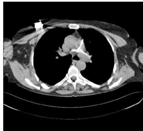
FIGURE 2: The appearance of the venous port catheter in the pulmonary artery on thorax computerized tomography.

the purse-string with the help of a hook (Figure 3). A hemodynamic impairment requiring an access to the cardiopulmonary bypass did not occur. When main and access ports of the catheter were examined, it was thought to be dislocated from the port access and moved as a result of the pinch-off syndrome developed due to pinching of the catheter between the first rib and clavicle and between subclavius muscle and costoclavicular ligament.