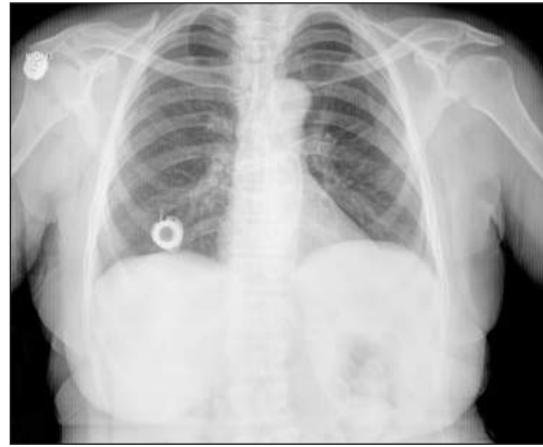
FIGURE 1: The venous catheter is seen in the left pulmonary artery on the control posteroanterior chest X-ray of the patient.