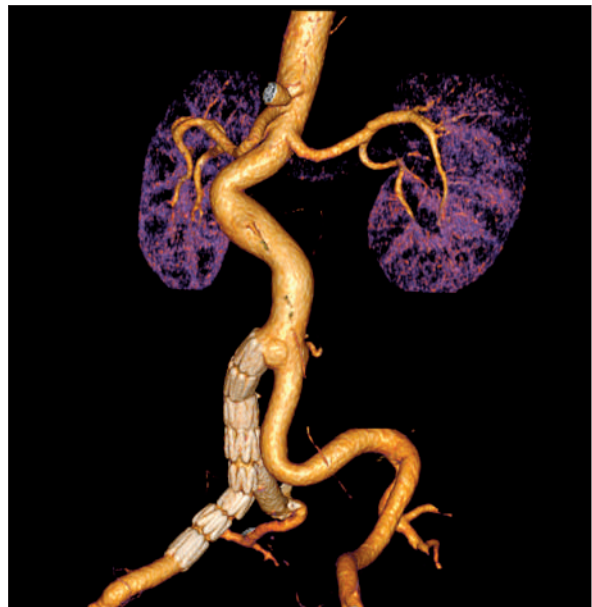
FIGURE 3: 3-D reformatted CT angiography image obtained at the 4 th postoperative day shows successful exclusion of right common iliac artery aneurysm with iliac branched endograft by preserving internal iliac artery.

Iliac branched endograft, also called as iliac bifurcation device, has been developed to protect internal iliac artery flow in the treatment of common iliac artery aneurysm extending to bifurcation. The applicability of this endograft necessitates secure segments with normal vessel diameters. Therefore, external iliac artery length and diameter should be at least 20 mm and 8-11 mm, respectively, for pro-