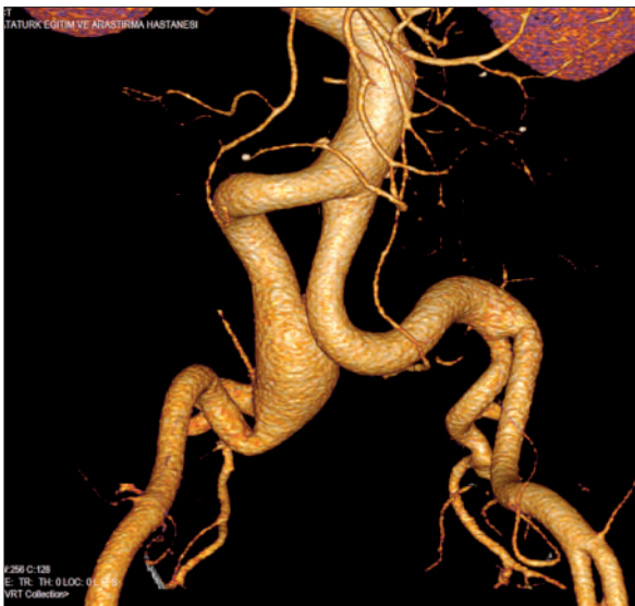
FIGURE 1: 3-D reformatted computerized tomographic angiography image shows isolated fusiform right common iliac artery aneurysm extending to the iliac bifurcation and excessive angulation of the iliac arteries.

After one day intensive care unit stay, the patient was taken into cardiovascular surgery ward. The patient was discharged uneventfully on the